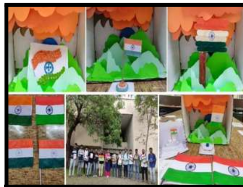
Flag Making Competition