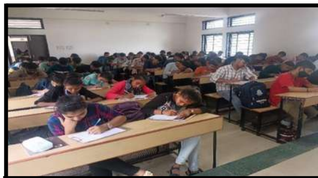
Essay Writing Competition