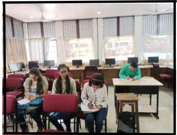
Innovative Ideas for Combating Climate Change (I2C3) Competition