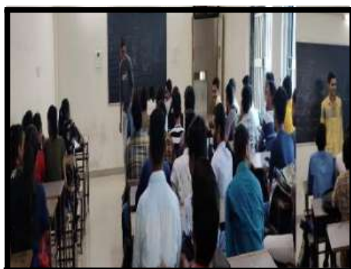
Elocution & Singing Competition