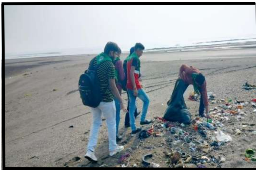
A Seminar on “Cyber Crime Awareness” organized at SSEC, Bhavnagar on 08/09/2022