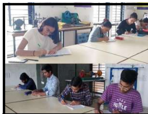
Essay Writing Competition