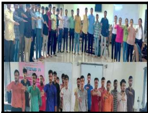
Reading of Resolution & Pledge Taking

Following is the activity wise report from 27th July to 8th August 2022 on 'Har Ghar Tiranga', a campaign under the aegis of Azadi Ka Amrit Mahotsav