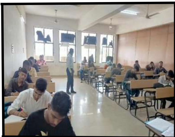
Slogan Writing Competition