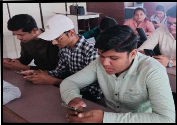
NSS Volunteers participating in online Quiz Competition