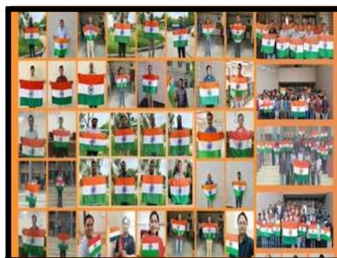
Registration on portal to pin a flag and upload a selfie with Tricolor