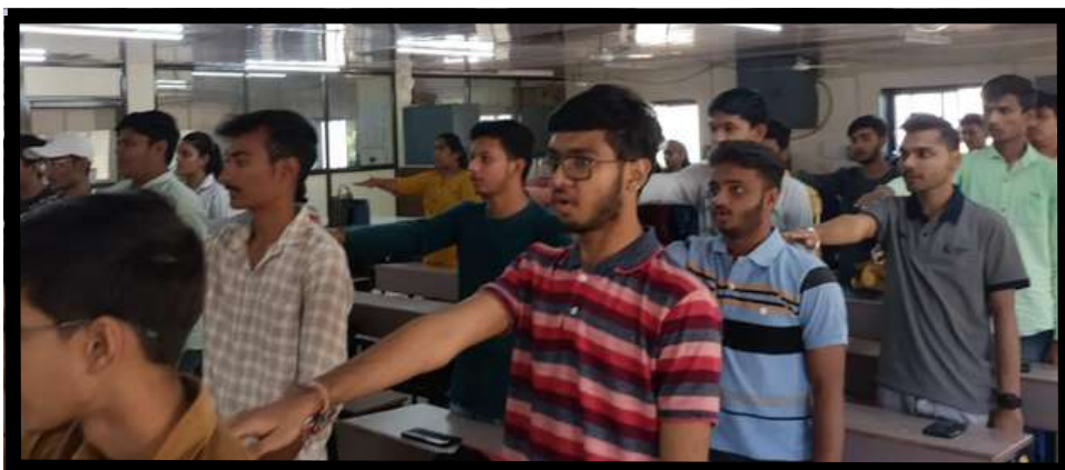
Reading of Preamble to the Constitution