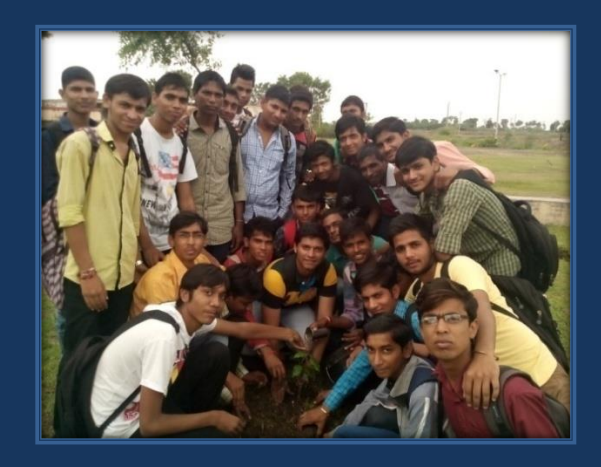
Students participated in tree plantation activity on 26<sup>th</sup> January, 2014.