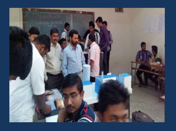
Principal with sineor faculty observing activities.