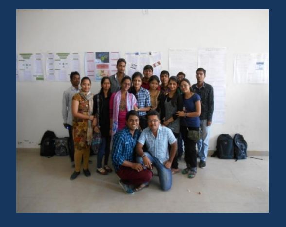
Students of PED participated with innovative ideas at "Open House".