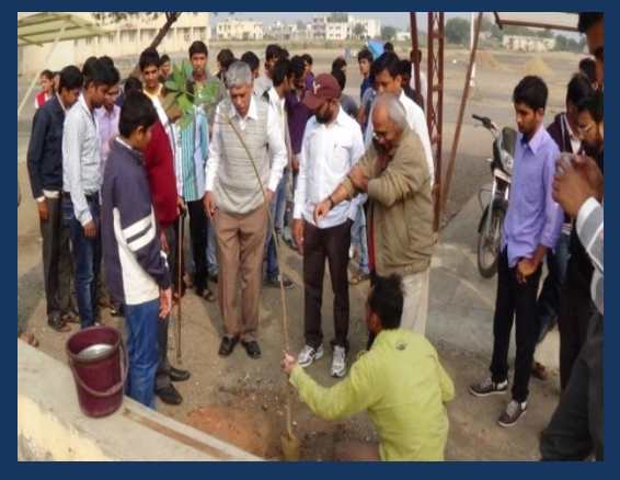
Sr. Faculty with students participated in tree plantation activity on 26<sup>th</sup> January, 2014.