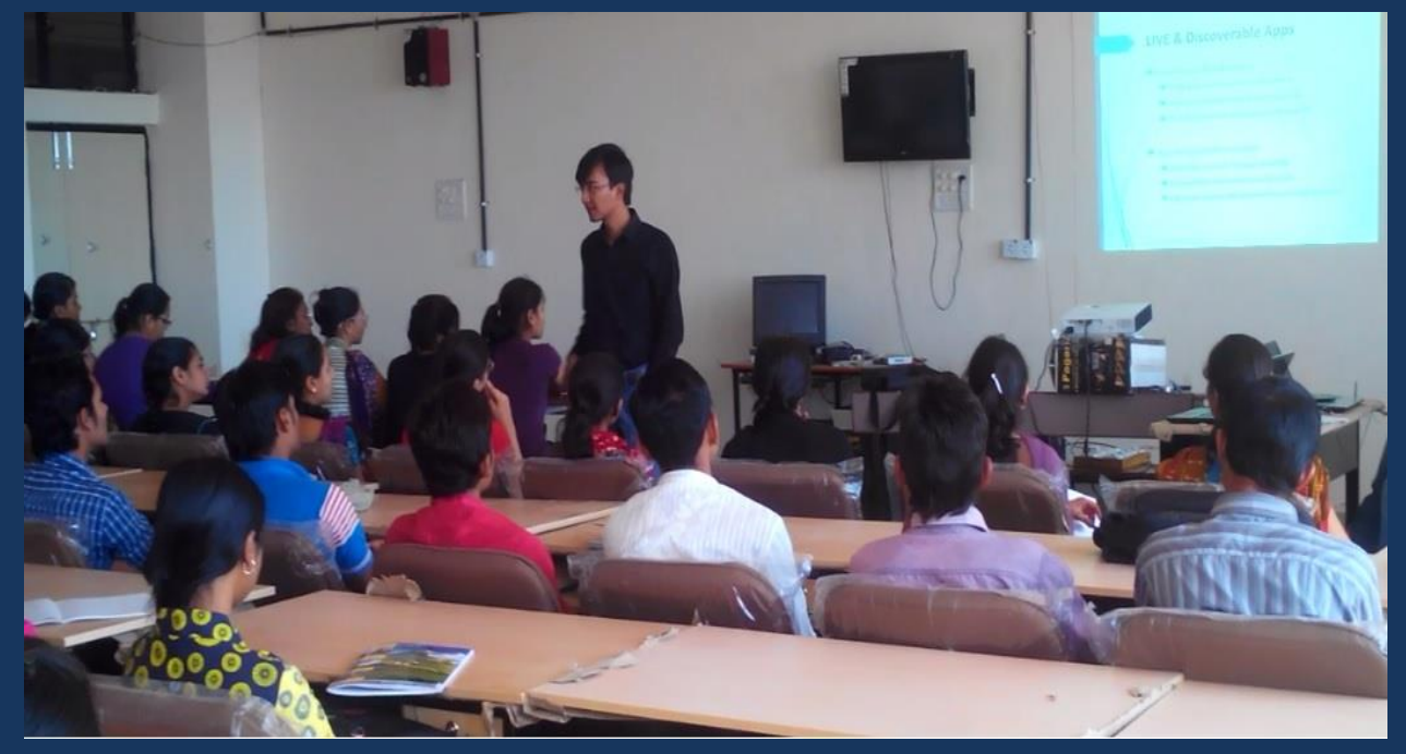
Students attendig a Seminar in the college