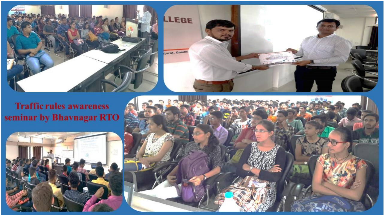
Traffic rules awareness seminar by Bhavnagar RTO

As a part to increase the awareness amongst the students and faculties we had invited "TEAM" (Traffic Education & Awareness Mobile) at our institute on 27 th July 2018. Members of TEAM used different videos and power point presentation to aware all. They convey their message successfully about road safety among all 180 students.