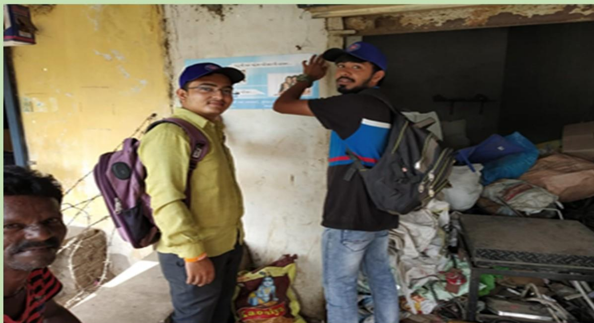
Anti-addiction drive at village shampara

On 29 th June 2018 NSS volunteers organized a rally and conducted a door to door visit at Shampar village. They visit each and every house to spread the message how this drug with other addiction is harm full for their families. By carrying placards on anti-drugs themes, volunteers marched in the streets of Shampara shouting slogans and while telling residents to stay away from drugs and alcohol.