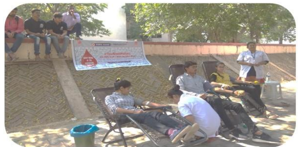
Blood Donation Camp at SSEC, Bhavnagar